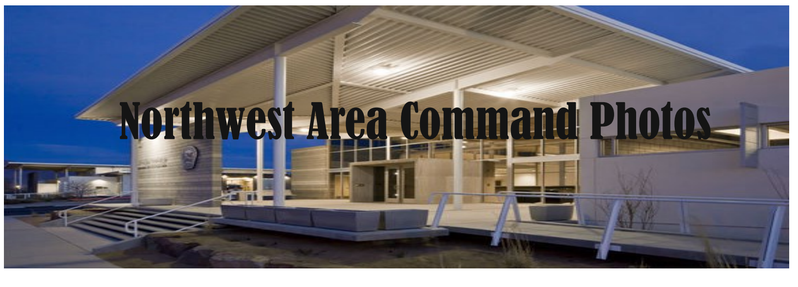
NW Area Command Officer Appreciation Day